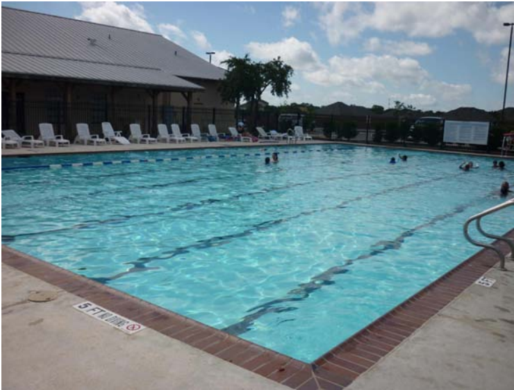
VWOA Community Center Pool

Adjournment: There being no further business before the Board, the meeting was adjourned at 8:45 pm.