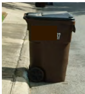
Trash Container properly placed in the street.

Vehicles are also not allowed to block the sidewalk portion of the driveway in any fashion. Vehicle registration and safety sticker violations and any other potential traffic violation will be referred to the Bexar County Sheriff's Department for police action. There is no angle or head in parking allowed on any public street in the Villages of Westcreek. This applies especially to the cul-de-sacs that we have in our villages.