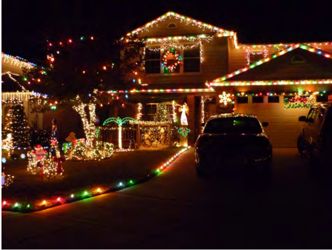
Best Holiday Spirit

Thank you to everyone who entered the Holiday Lighting Contest, and congratulations to the winners!