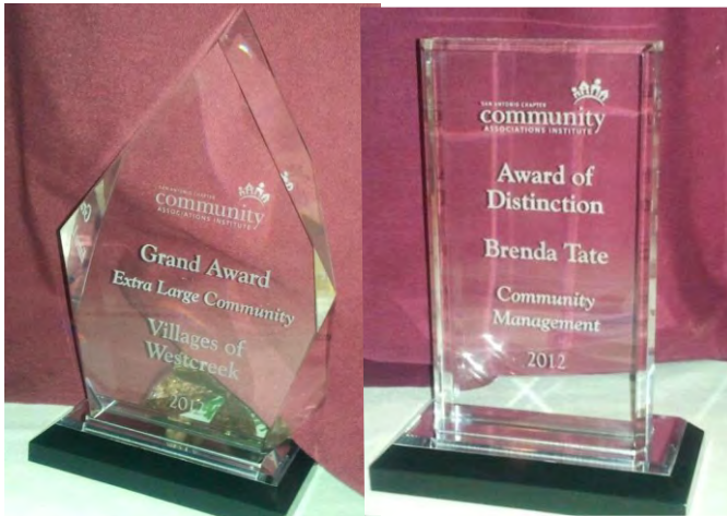
Grand Award for Community of the Year

The Villages of Westcreek received two prestigious awards from the San Antonio Community Associations Institute. We are very proud to accept both the Grand Award for Community of the Year and the Manager of the Year Award of Distinction. We are equally proud to have received both awards for the second year in a row. Onward and upward team Westcreek!