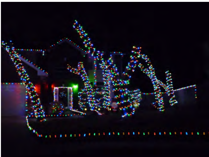
Best Use of Lights